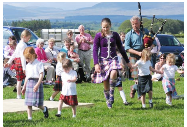
Young dancers at the annual Gargunnoch Show