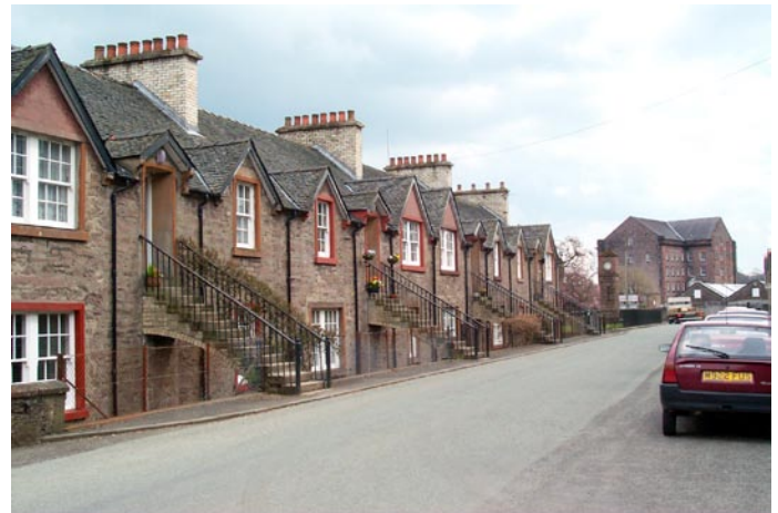
Top - Doune Main St and its ancient Cross. Above left - Doune Church meeting room is entered via the door below the blue sign. Above right - Deanston with its distillery in the distance.

Nearby, Deanston village lies on the south bank of the River Teith, a mile to the south-west of Doune.