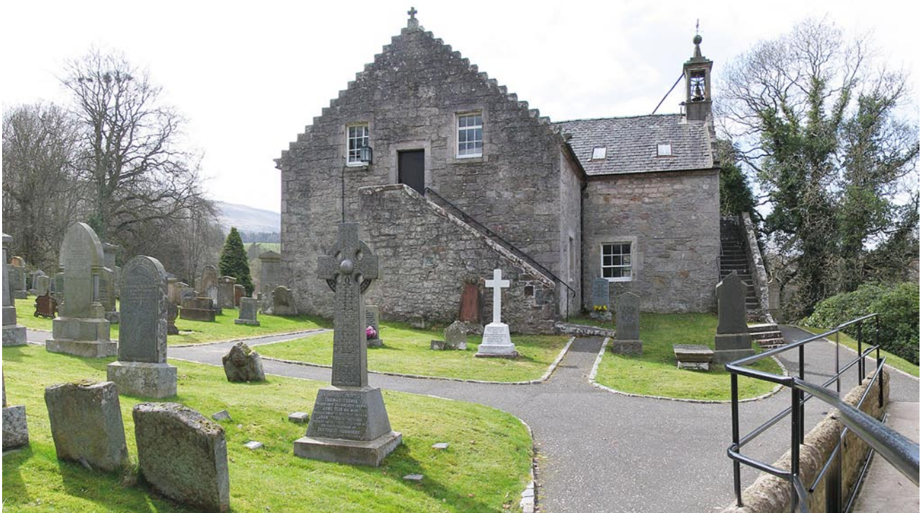
Situated on a site used for places of worship since the 1500s Gargunnoch Church is in good condition internally and externally. The white marble cross is that of a former minister and great benefactor to the village

The Ross Anderson Room, built in 1963 and extended in 2002 is situated at the gates, adjacent to the Vestry, built in 1776. The Church Recorders of the Stirling Decorative and Fine Arts Society recorded the church furnishings between 2002 and 2005 and presented the Church with a copy.