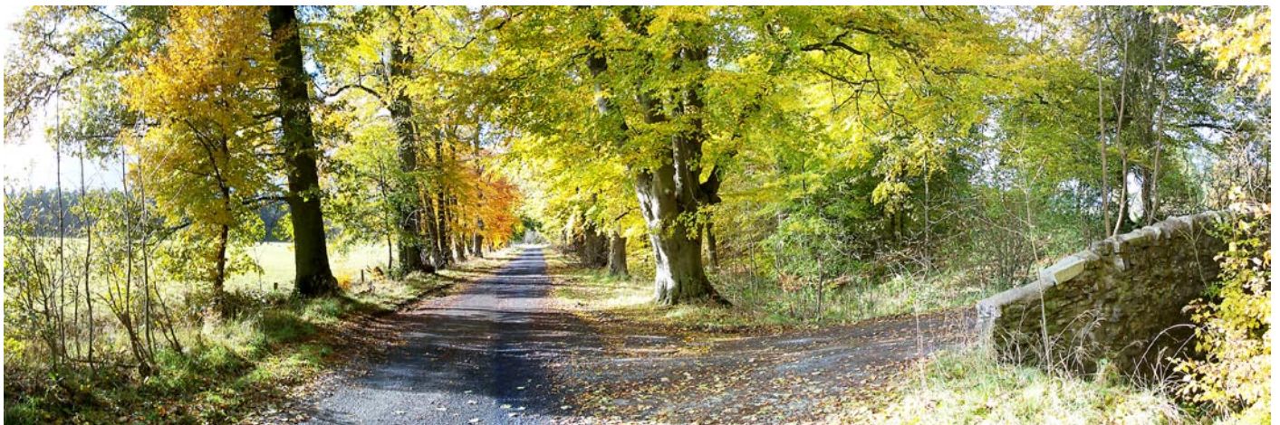
Lime Avenue, near the entrance to Safari Park, Blairdrummond

It seats 240, is in good repair and has recently been decorated internally and has had new lights fitted. It features several fine stained glass windows and some interesting memorials.