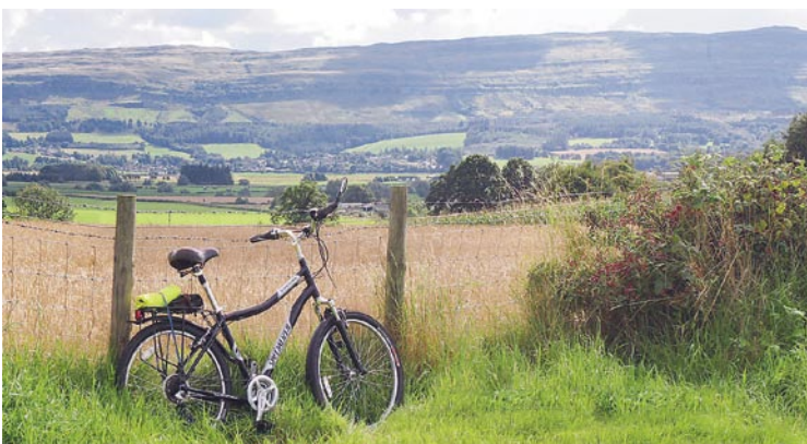
The Coldoch Road, Blairdrummond looking south to the Gargunnoch Hills