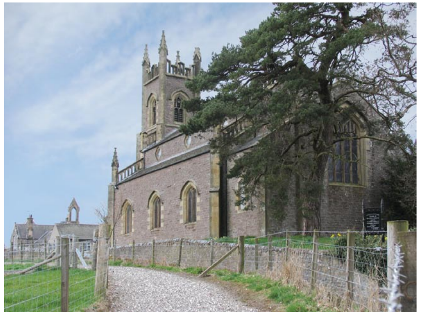
The parish church at Blairdrummond, with the Primary School beyond, is an impressive structure. The recently constructed footpath in the foreground leads down to the Community Hall, avoiding the busy main road

The present church, standing on the west side of the main road,