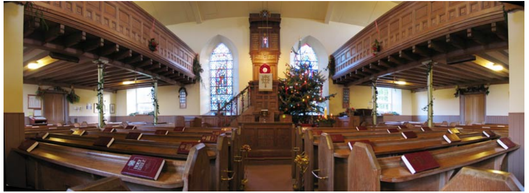
The church is T-shaped with stained glass windows on either side of the pulpit and three galleries, accessed via external stairs. The main entrance is through the door to the left

Past recipients of the congregation's generosity have been... African Harvest, Barnabas Trust, Blythswood Care Shoebox Appeal, UNICEF, START-UP Stirling, Tearfund, Water Aid and our Missionary Partners in Zambia.